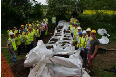
Pricewaterhouse volunteers - Count them!

in attracting more volunteer groups from external organisations than ever before to come and join us for their Community Days. In fact we had twelve companies take part last year and we have already received a booking for 2015 from a new company called Drive Hire. Throughout last year we have had our regular groups in attendance, including Santander, who joined us in June, September and October. Pricewaterhouse-Coopers (PwC) made a return visit in May. In addition,