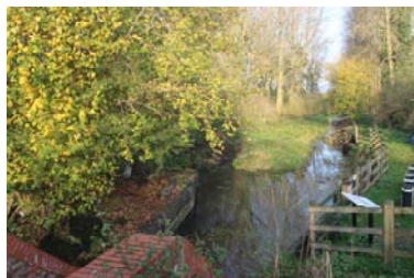
Clearance Oct 2014

This just left the trustees to clarify the position regarding Bourton Meadow and the Buckingham Canal Nature Reserve at Hyde Lane, and having successfully concluded those, the application was made to the Charity Commission to dissolve the old BCS charity in December 2014.