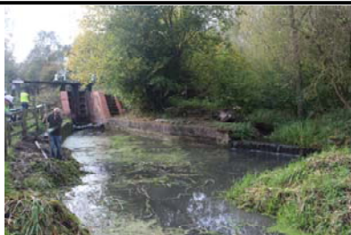
Clearance Oct 2014

2014 has been a year of transformation for BCS. The original Society was created in 1992 and eventually became an unincorporated charity. At our last AGM we discussed in some detail the conversion to a Charitable Incorporated Organisation (CIO). The new CIO was registered with the Charity Commission in April 2014 and the trustees subsequently agreed to transfer the assets and liabilities of the old BCS charity to the new CIO with effect from 1st August 2014.