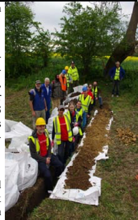
Santander volunteers start Bund build May 2014

A big thank you must go to all our volunteers who have worked on site in 2014, without which the efforts of the restoration work on the canal could not have been carried out. Most of the work in 2014 has been centred at Cosgrove and the Buckingham Canal Nature Reserve site at Hyde Lane. In 2014 we were very fortunate