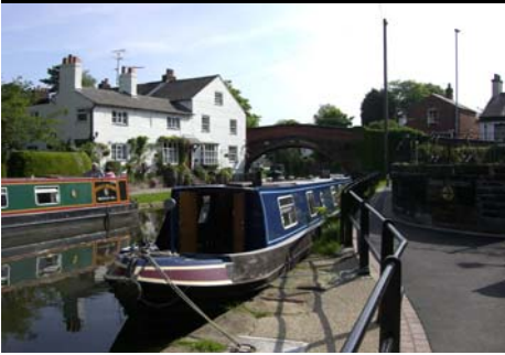
Balador at Lymm 15.05.2008