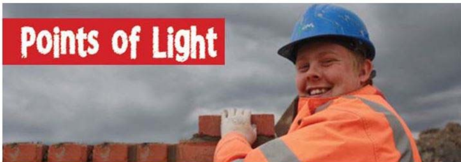
PRESS RELEASE: WRG volunteer wins award from Prime Minister

I first got involved with WRG because my father was determined that I wasn't going to spend the whole summer sitting at home. It was June 2009, I'd just finished my A-levels and was waiting to start University in October, so it was an understandable wish! He did some searching around on the internet, and having found the National Trust holidays to be far too expensive, searched for whether there was anything similar for the canal network. Unusually for me (I normally take forever to make a decision), I booked my first fortnight of camps within an hour of receiving the link.