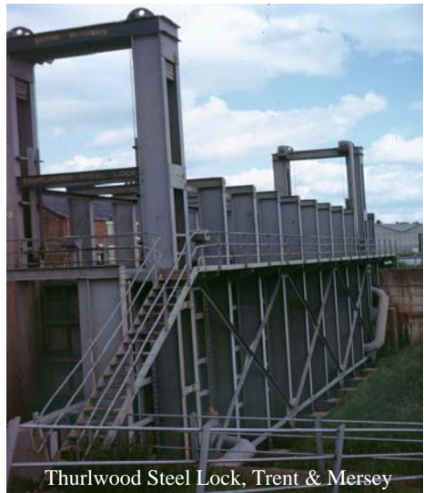
Thurlwood Steel Lock, Trent & Mersey Canal, Aug 1965