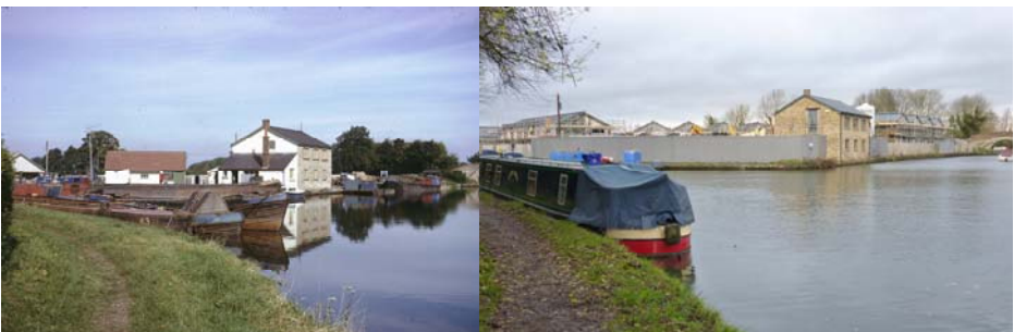
Marsworth Junction in September 1965 (Chris Clegg) and December 2014 (Judy Clegg)