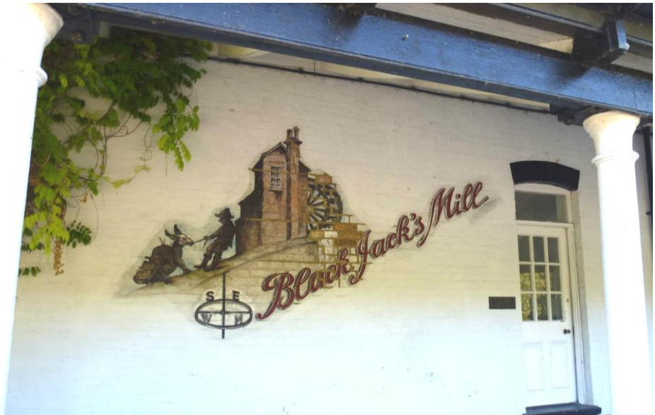
Black Jack's Mill alongside the Grand Union at Black Jack's Lock, Harefield.