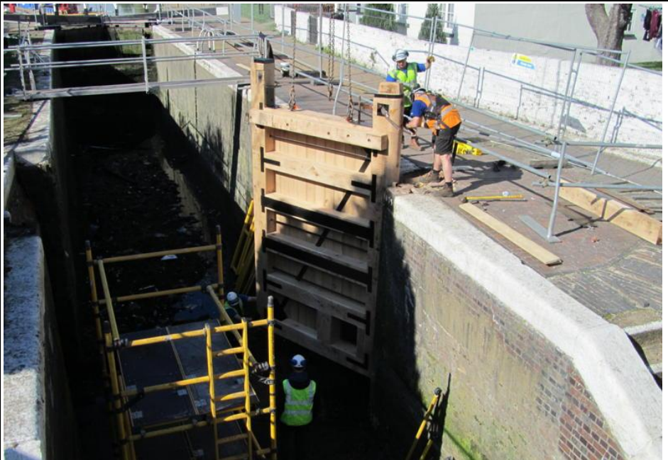
New gates being installed at Norwood top lock.