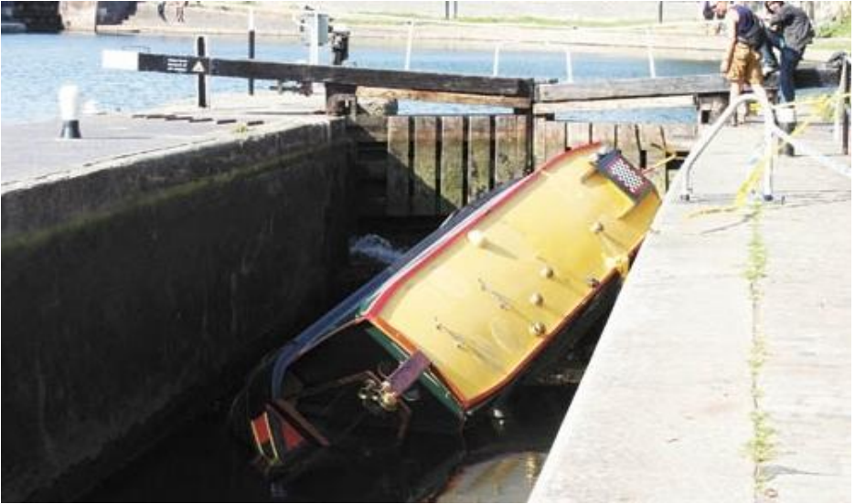
Andrew West's 40ft narrowboat, Saxon, from St Pancras Cruising Club caught on the cill at Kentish Town lock, Camden. The lock was out of action for almost 48 hours.