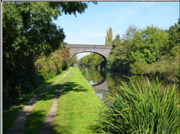
The Grand Union where the Chiltern Railway line crosses just by HOAC