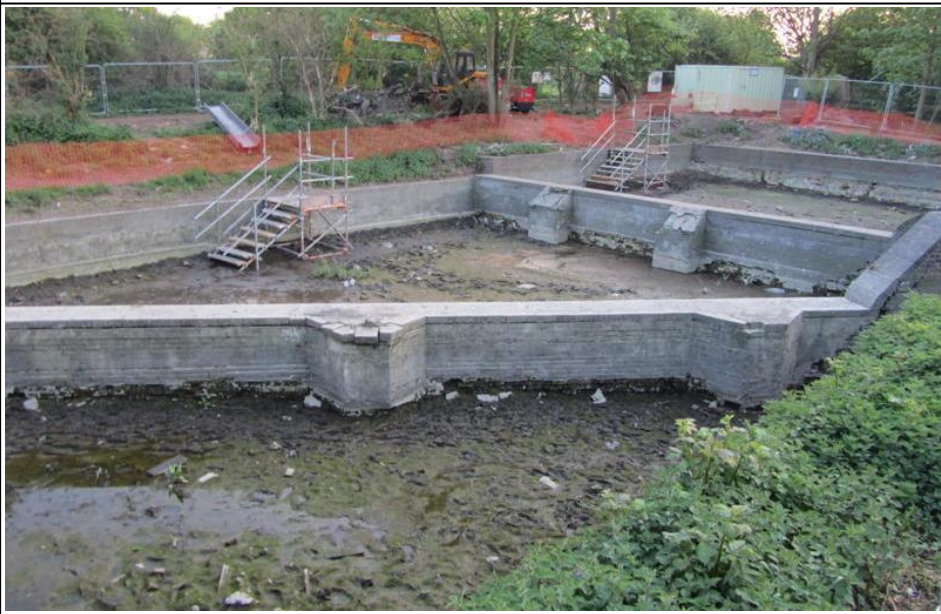
Below: Side ponds get cleared on the Hanwell locks.