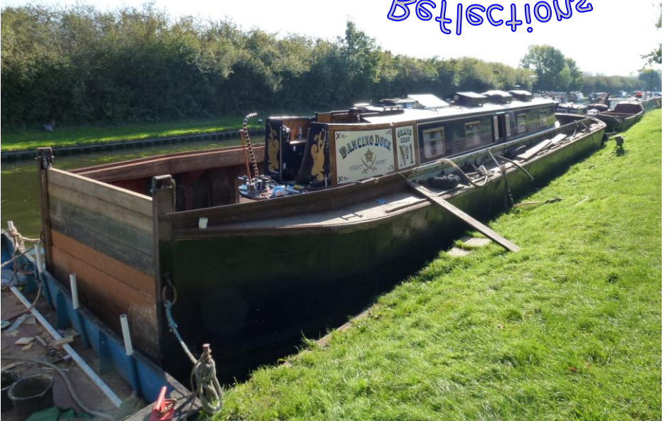
Floating dry-dock moored at Denham. Boats enter through the open front, which is then stopped and the water pumped out, leaving the boat high and dry for cleaning and painting

Gongoozler: an idle and inquisitive person who stands staring for prolonged periods at anything out of the common.