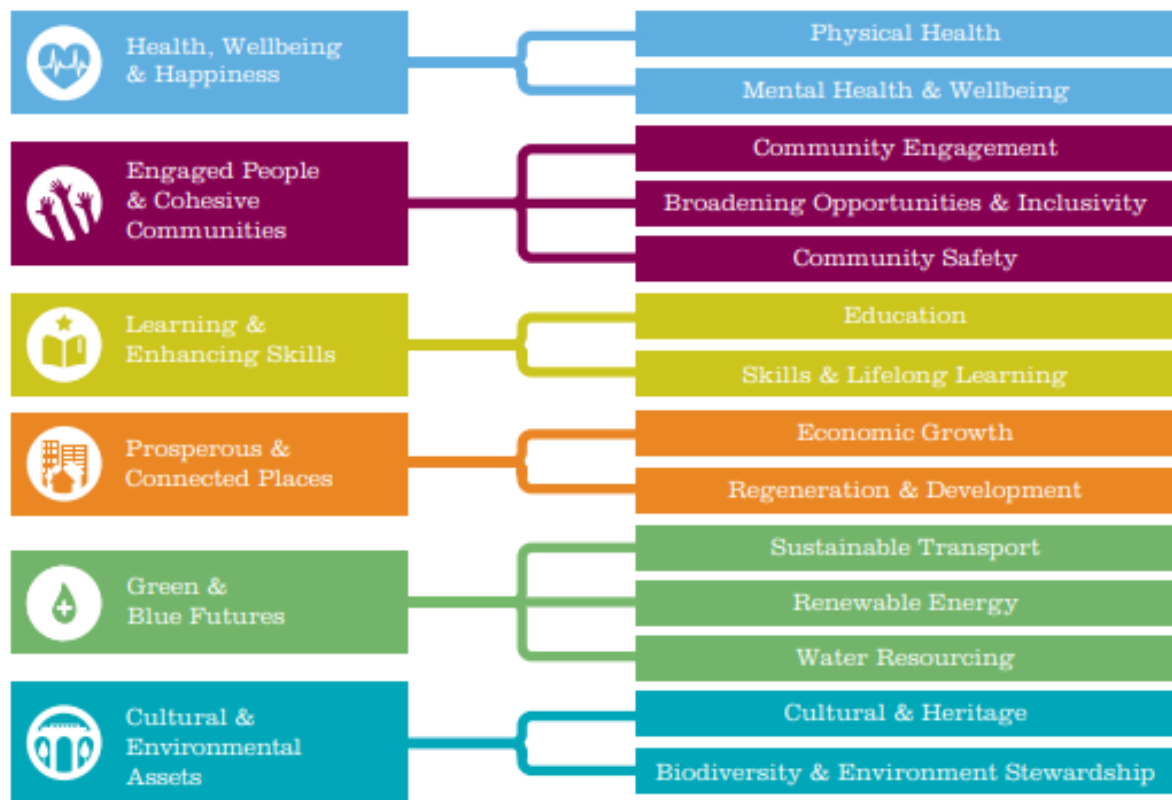
Figure 5: New Canal & River Trust Wellbeing Outcomes Measurement Framework (2017)

funders for waterways they “cannot depend solely on storytelling” (p4) and so are attempting to develop measurement approaches which capture the value (particularly the monetary value) of a wide range of wellbeing factors to measure and justify interventions. Recent research published for Canal & River Trust 174 has attempted to draw many of these wellbeing factors into an ‘Outcomes Measurement Framework’ which draws on demographic profiling, Sport England and GP data profile data, Waterways Engagement Monitor and towpath survey data (existing tools), longitudinal studies of interventions in certain target areas, with ‘control’ areas either without water or not managed by Canal & River Trust also being monitored to try and tease out the value of Canal & River Trust interventions and the value of water in particular.