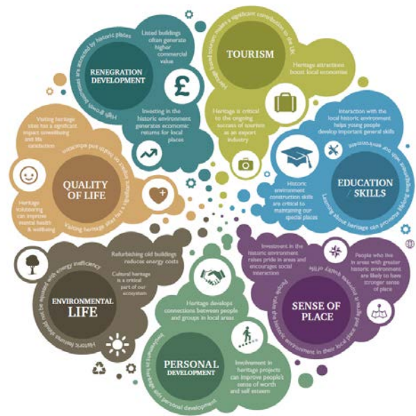
Figure 2: The Value & Impact of Heritage and the Historic Environment.

Figure 2, taken from the Heritage Counts report addressing how heritage can be valued, provides a useful summary of the areas discussed.