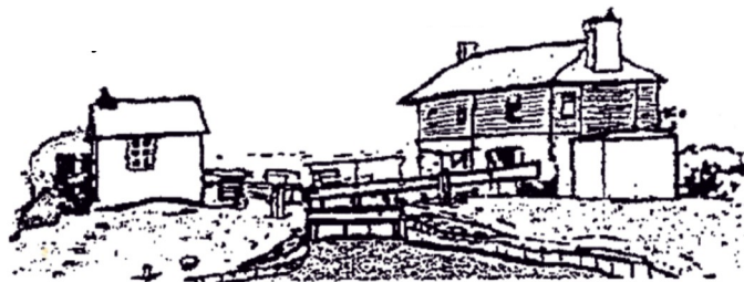
Top Lock Cottage and Lock-keeper's Hovel

The Nene Navigation opened from The Wash to Northampton in 1761. Sea Coal from the North-East was a regular cargo; also several timber yards were based beside the river. Once the Northampton Arm opened in 1815, the river traffic was largely superseded by canal traffic. This steadily declined although large quantities of grain were carried from London to Wellingborough by narrow boat until the late 1960s. The locks were rebuilt in the 1930s using similar dimensions to the locks being built by the Grand Union Canal Company north of Braunston. Had the Northampton Arm also been widened, the Nene could have seen a significant revival of through traffic from the east coast ports to Birmingham and beyond.